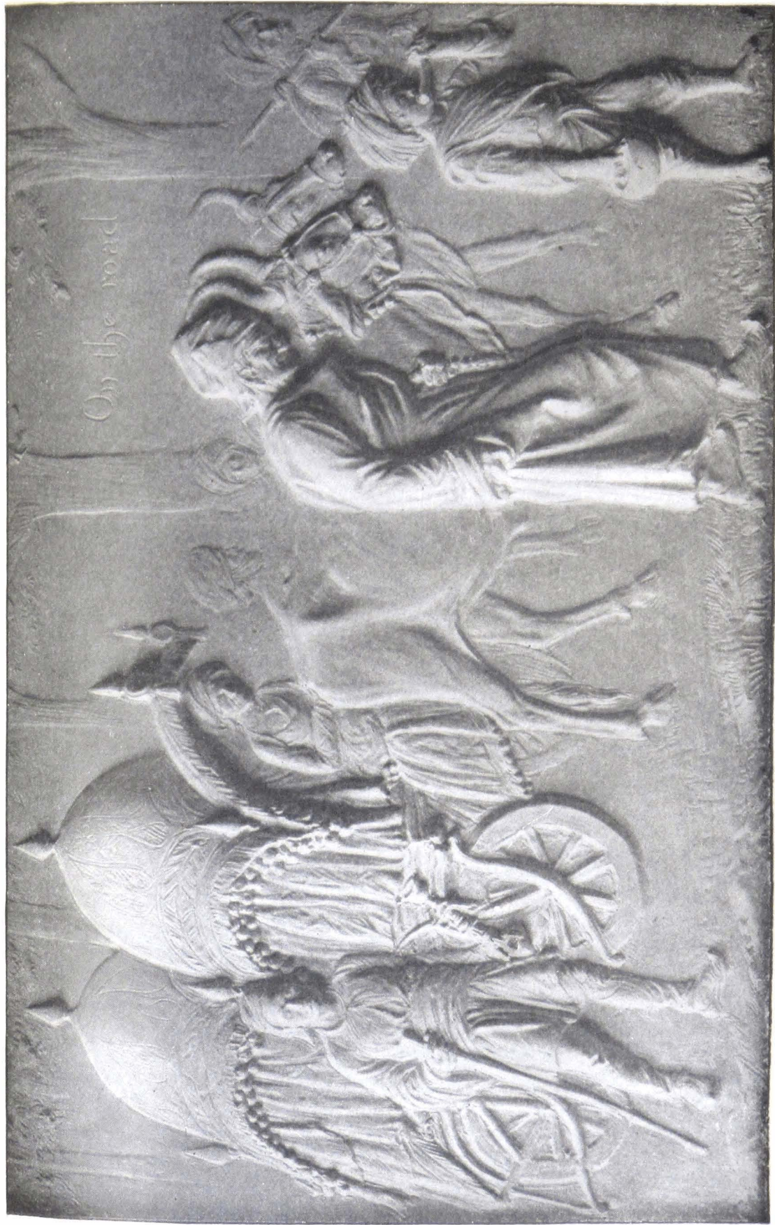
The Lama and Kim walked a little to one side; Kim chewing his stick of sugar-cane, and making way for no one under the status of a priest.