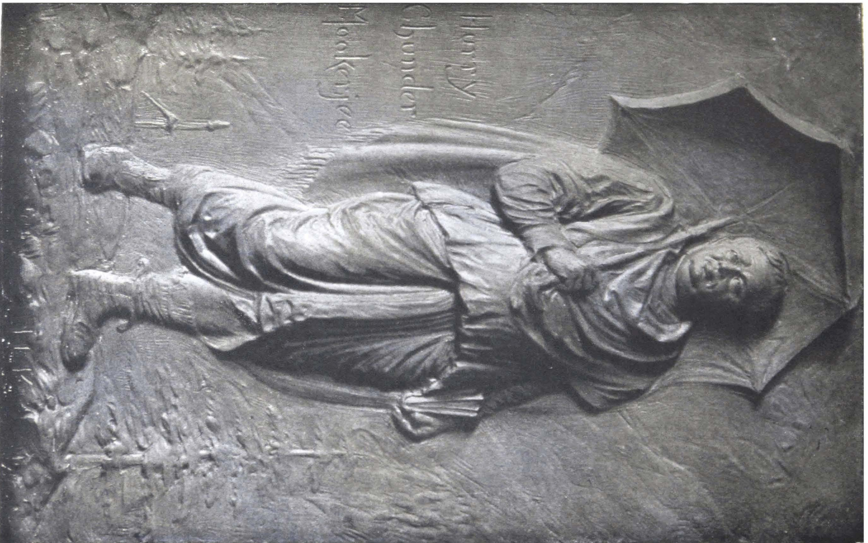
Full-fleshed, heavy-haunched, bull-necked, and deep-voiced.