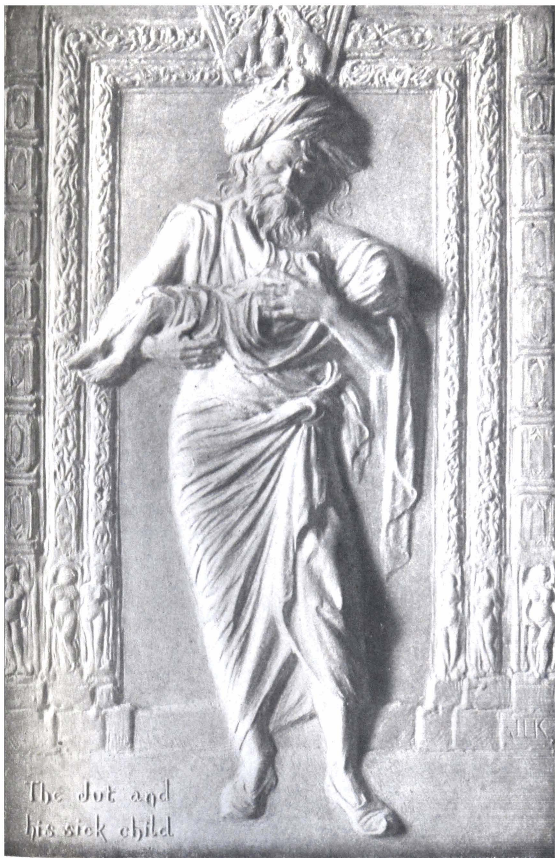
The Jot and his sick child

‘They are all most holy and—most greedy. . . . I have walked the pillars and trodden the temples till my feet are flayed, and the child is no whit better.’