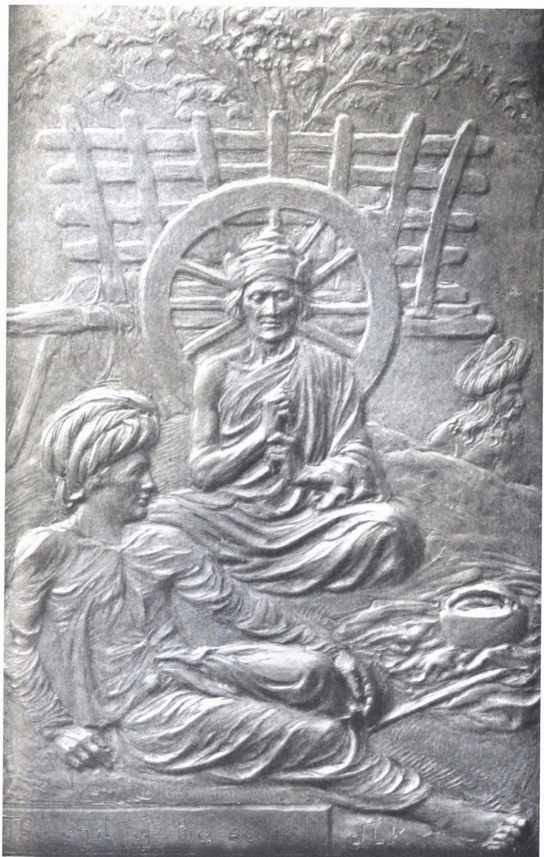
He crossed his hands on his lap and smiled, as a man who has won Salvation for himself and his beloved.