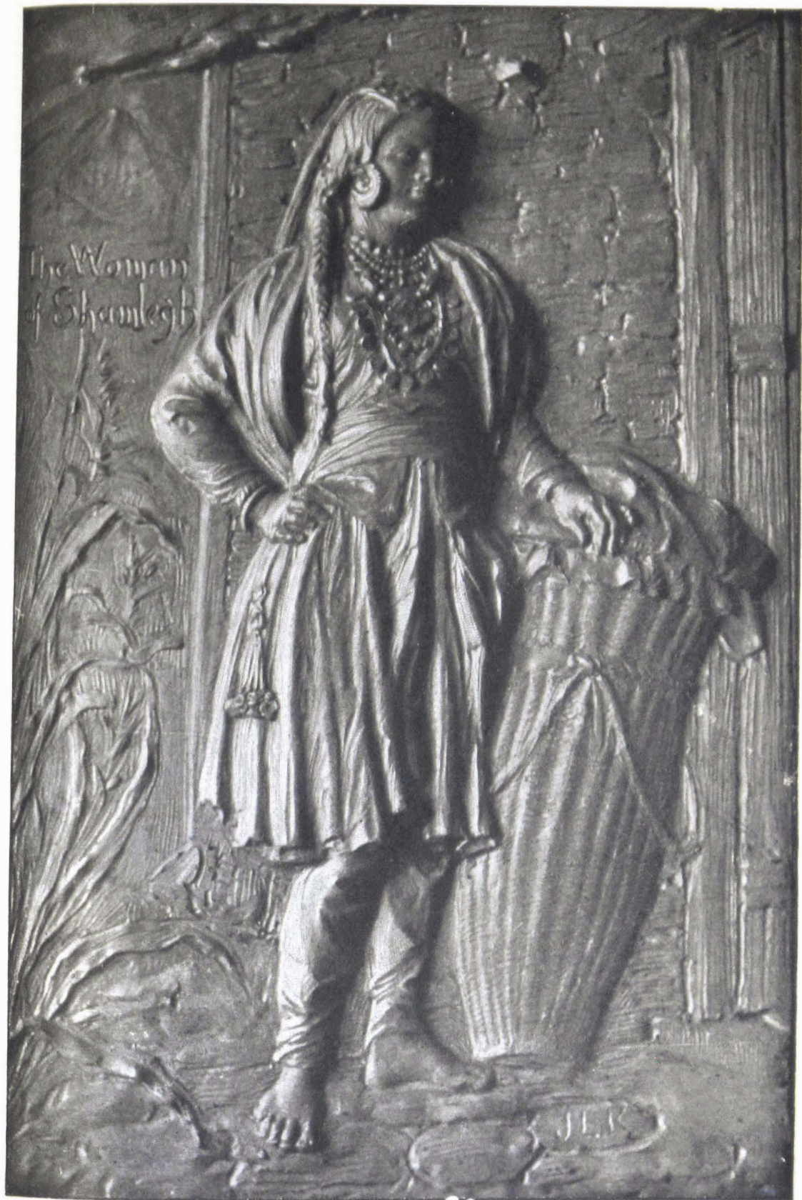
'I am the woman of Shamlegh.'